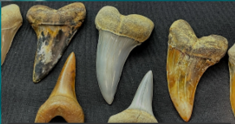
Ancient Mako teeth showing upper triangular and lower spear-like teeth. Specimens are on display at BVM

Some sharks' teeth don't fit in a single category. The ancient big-tooth mako that swam around what is now Bakersfield 15 million years ago had broadly triangular teeth in their upper jaws and spear-like teeth in their lower jaws. I like to think of them as sharks with a bit of etiquette—they held their food in place with their fork-like lower jaw while cutting it into bite-sized pieces with their upper jaw.