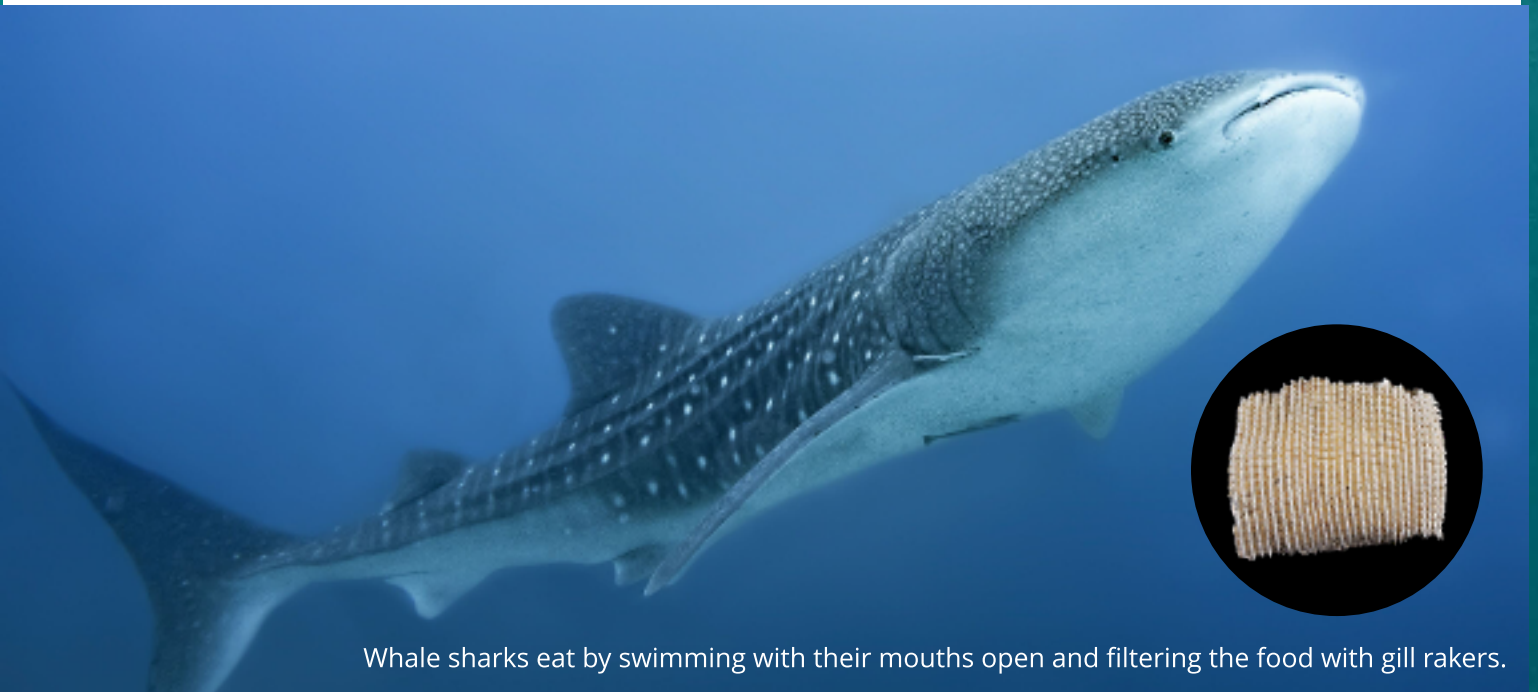
Whale sharks eat by swimming with their mouths open and filtering the food with gill rakers.

The next time you find yourself peering into a shark's mouth, hopefully on a TV or movie screen and not when you are both in the water, take a minute to look at its teeth; you'll then know whether you'd hold a place on its menu.