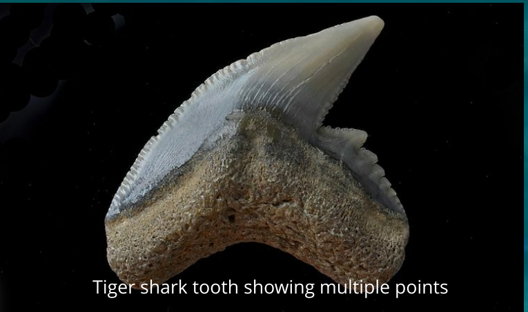
Tiger shark tooth showing multiple points

The modern tiger shark is another mixed-tooth shark, but in a different way. Both its upper and lower teeth are similar, and feature several points on each tooth. The front-most point is much larger and fairly spear-like, and the smaller points form an edge of serrations slanting down from the front point to the back of the tooth. It functions both as a spear-like tooth, with the long leading point catching and holding prey, and a broadly triangular tooth, as it uses the other points to cut